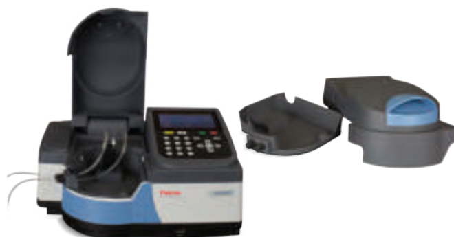
840-278200 Accessory Kit For Hose Entry/Exit