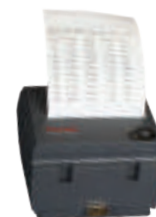
840-278000 Printer Accessory