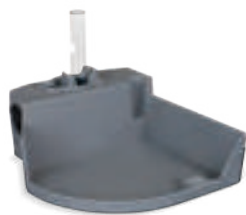
840-277500 Test-Tube holder