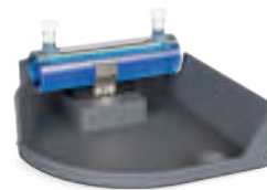
840-277800 5-100mm Path Cylindrical Cell Holder