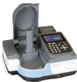
840-277600 Tall Test-Tube Cap