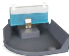
840-277700 Long Path Rectangular Cell Holder