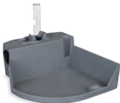
Optional Test Tube Accessory