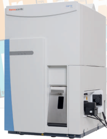
Thermo Scientific iCAP TQ ICP-MS